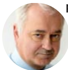
argues Andrew Murray

A bellicose policy resolution at TUC Congress and the responses to it show that building a mass movement against imperialism inside unions, workplaces and communities remains a key task of peace activists and progressives,